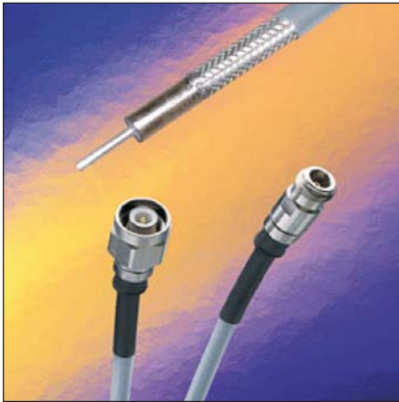
Figure 2 · An example of current flexible cable technology is Semflex's LA Cable, which uses silver-plated inner and outer conductors, microporous PTFE dielectric, helically served flat braid plus 97% coverage round braid, and either PTFE or polyurethane jacket.

effectiveness. Recent work includes improved braiding machinery to achieve precise control of the pitch and tightness of the weave. The size, shape and composition (e.g., plating) of the braid strands has been explored, including the use of flat wires that offer very high percentage shield coverage.